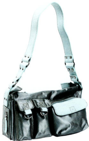
The bag boutique